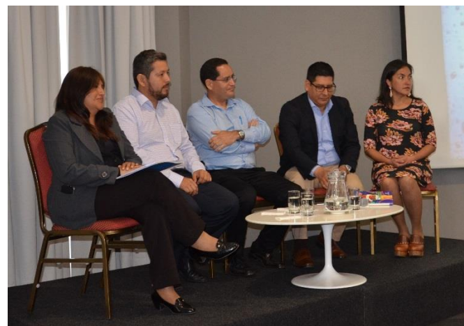
Panel on the topic of water footprint

The afternoon was largely dedicated to thematic discussions in small groups. Six topics were proposed (Topics: Social and financial inclusion, water governance, private sector/PPP, water quality, fragile states) and participants had the chance to choose three of them. The three rounds of group discussion were facilitated by a participant each. The methodology used was the one of “Open Spaces”, meaning that there is no strong input by the facilitator but really the group decides what they want to discuss within the given topic. At the end of the day the five case studies were presented in 2-minute pitches in order to provide a taste of the main input of day 2 (and of the event as a whole).