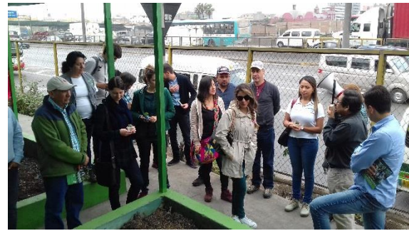
Visit to a park where treated wastewater is used for irrigation (left) and to a compost site at a local flower market (right).

During the second visit, the participants got familiar with a wastewater treatment plant where wastewater is treated up to a grade where it can be used for watering a neighbouring park and potentially other areas as well. The park is a beautiful recreational area for people living in the area. Before constructing the wastewater treatment plant, this place was desert: due to the dry climate in Lima there was only sand there. Now, it is a green area with a lagoon, animals, a plant greenery and an educational centre.