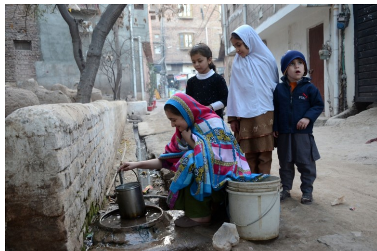
The SDC is committed to equitable water distribution

With more than 5.4 million people (18% of its population) lacking access to safe drinking water, both water governance and sound management of water resources are highly relevant for the Khyber Pakhtunkhwa (KP) province. In line with the 2018 approved National Water Policy, and drawing on decades of SDC water sector support in this province, the project aims to strengthen provincial water institutions to implement the national water policy and deliver water services, especially to vulnerable communities.