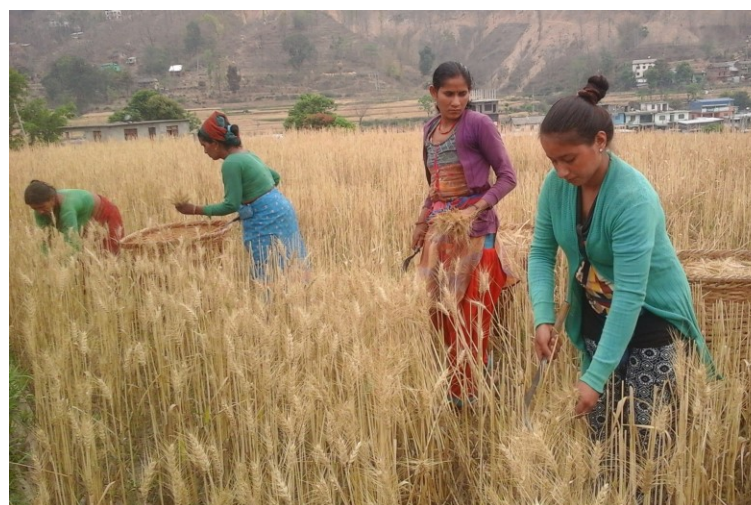
Farmers of far-western Nepal harvesting wheat

Until 2018, the project completed 550 irrigation schemes covering 8300 hectare of agricultural land thus benefitting 29,000 households of small holder farmers.