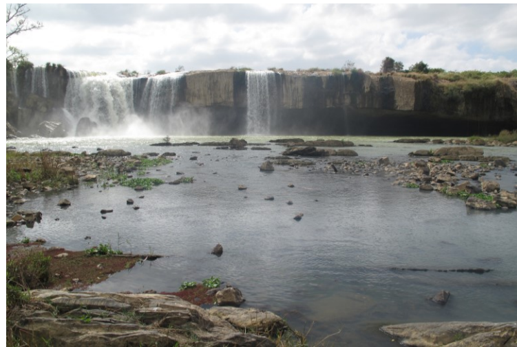
Waterfall Dray Nur in the upstream of Srêpôk