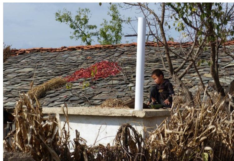
Double pit latrines are currently promoted by SDC as an adapted, safe technology which allows for human wastes to be used as resources.