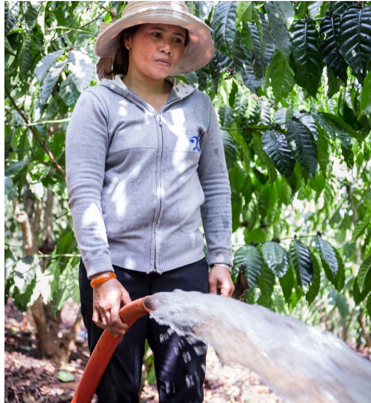
Farmer irrigating in Lam Dong province (2017)

After a successful phase 1 (6.2014 – 12.2017), phase 2 is continuing until December 2019. The total value of the project is CHF 2.6 million, equally sponsored by SDC and Nestlé.