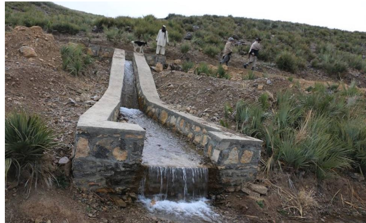
Improved irrigation in two provinces is among the outcomes of the project

phase now. Among the expected results are improved irrigation systems, improved access to WASH services, and improved protection against floods and droughts.