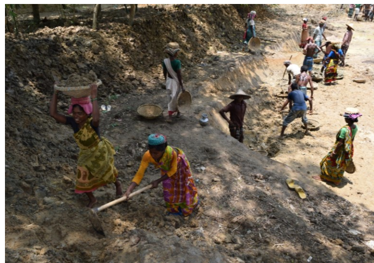
Surface water retention scheme and employment opportunity through the IWRM project

The Barind tract in North-Western Bangladesh is a dry area classified as “hard-to-reach” by the Government of Bangladesh with above-average incidences of poverty, marginalization and water scarcity due to over-abstraction of groundwater, changing rain patterns and contamination. By promoting the coordinated, equitable and sustainable development and management of water, land and related resources, and addressing the institutional challenges associated with integrated water resources management, the project intends to ensure access to sufficient