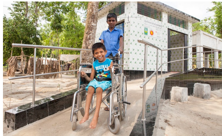
A school latrine constructed under a HYSAWA project with ramp access, making it more accessible for students with disabilities

better access to effective, accountable, inclusive and sustainable local public WASH services.