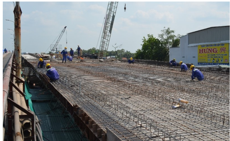
Infrastructure investment to reduce flood risk and improve connectivity in Can Tho city

Situated in the middle of the Mekong Delta of Vietnam, Can Tho city is susceptible to flooding caused by Mekong alluvial overflow, high tides, and extreme rainfall events. To address the challenge, Swiss State Secretariat of Economic Affairs (SECO) in collaboration with the World Bank has supported the city of Can Tho to implement the Urban Development and Resilience Project. The project aims to increase the flood resilience of more than 1.5 million people living in Can Tho city. SECO has co-financed USD 10 million grant for the technical assistance package complementing USD 320 Mio physical investment. The project duration is 2016-2021.