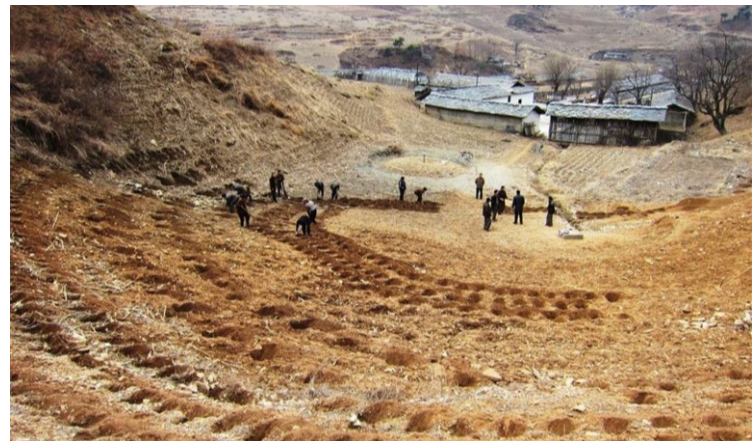
Planting of trees in a protection perimeter around a source intake