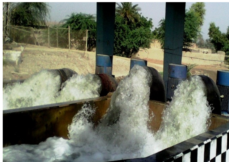
Access to clean water is a fundamental right.

in one zone nearly 60,000 connections were regularized and brought into the utility's revenue net. During the reporting period the service provider established 800 new connections, benefitting nearly 48,000 people. Additionally, SDC-funded components also included training of 5,500 staff in social (public dealing, ethics) and technical (water, sanitation and solid waste) aspects. For most of the staff this is the 1 st time they have ever been trained in a class room environment in their service of over 20-30 years.