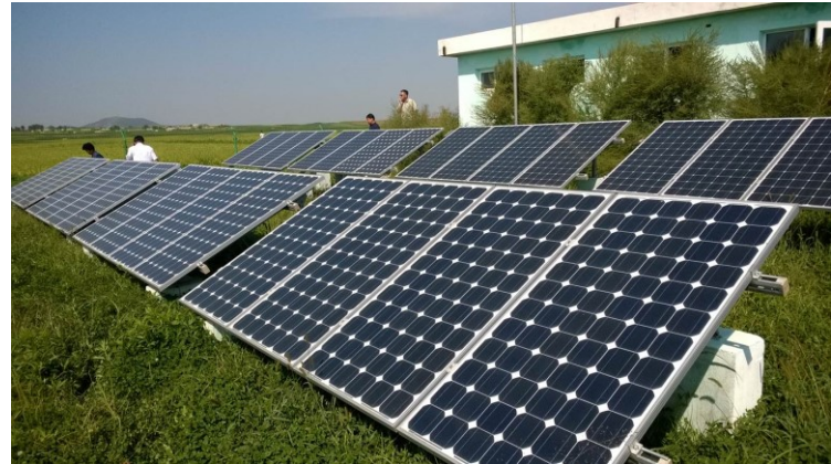
When water has to be pumped solar panels are installed to reduce dependency to external energy sources.

Today the SLM and the WASH projects complement each other, contributing to a more resilient watershed which in turn leads to a more sustainable water source.