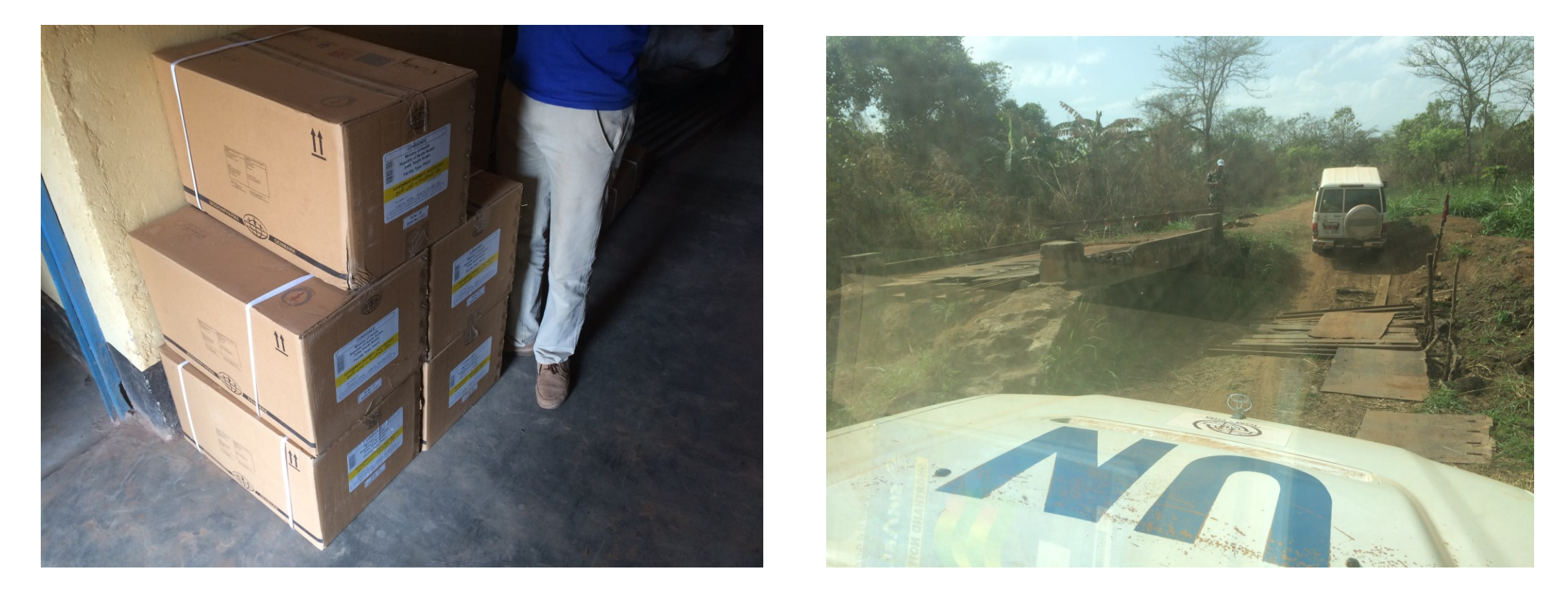
3 month medical supply for a primary health care center in Yei River State