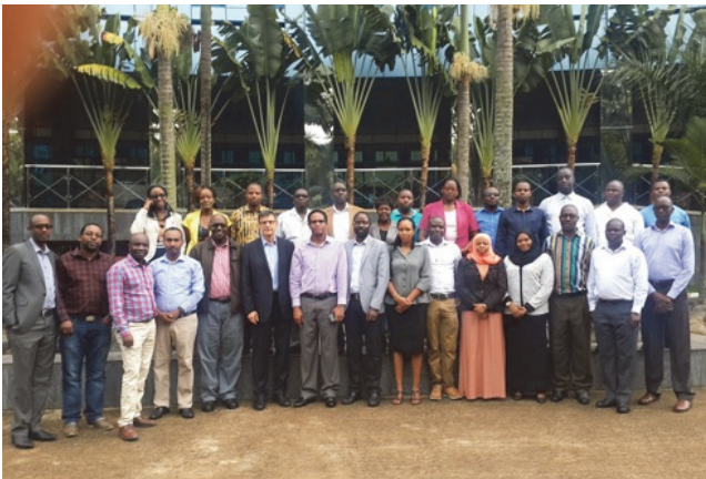
1 st EAC Joint Assessment MER (October 2015)

Work by Swissmedic is done in close collaboration with the WHO which assumes the technical coordination and lead. Swissmedic contributes to the development of technical guidelines, their implementation and maintenance, to joint assessments and inspections as well as training programmes and other activities in the four areas listed above. The approach developed within the EAC will be used as a basis for similar programs in other RECs in sub-Saharan Africa.