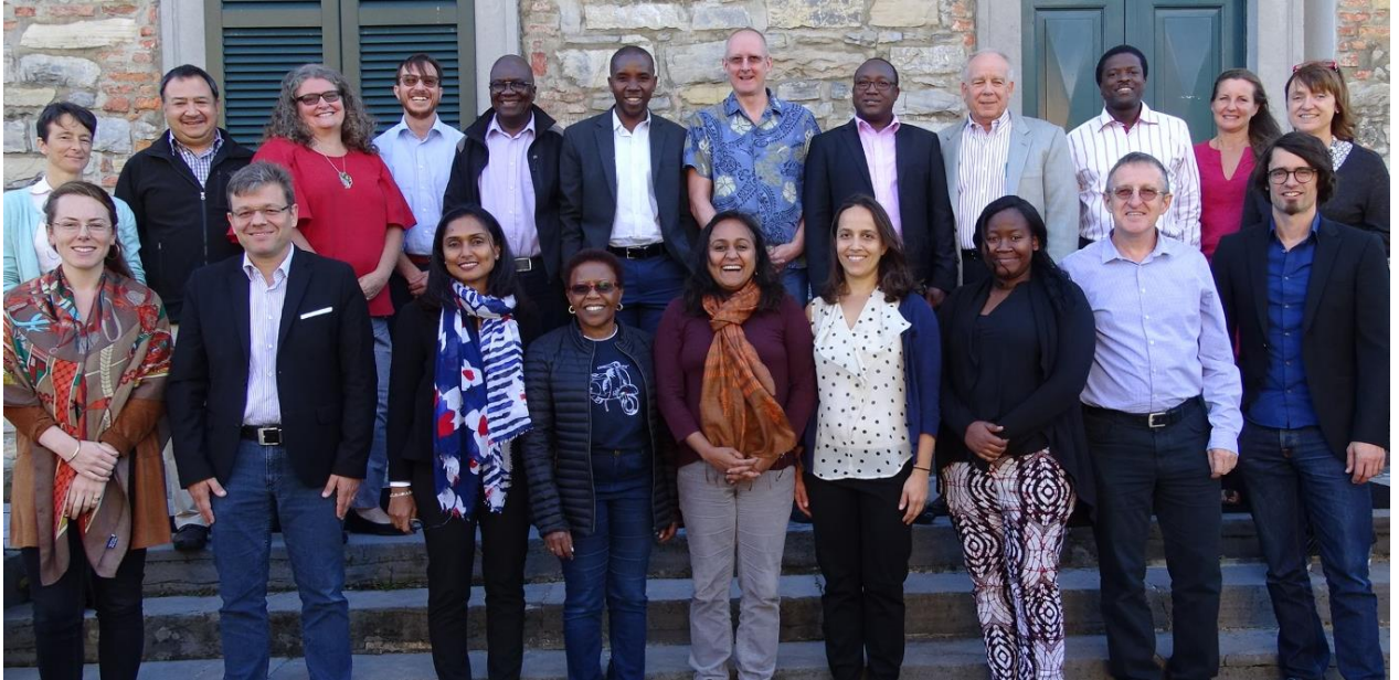
Bellagio Center, Postharvest Management Workshop Participants