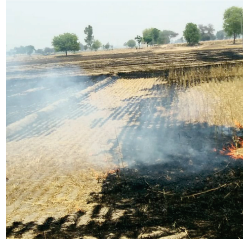
Lead photo, photos 1, 2 and 3 © TERI