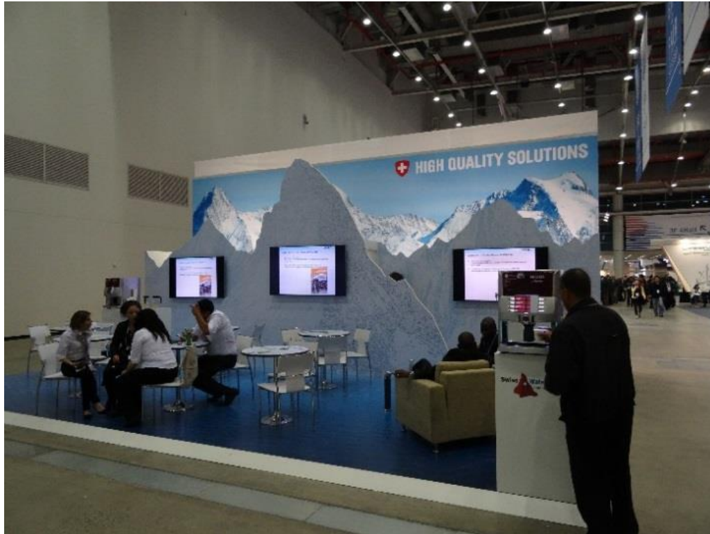
Swiss Stand at the World Water Forum 2015 in South Korea