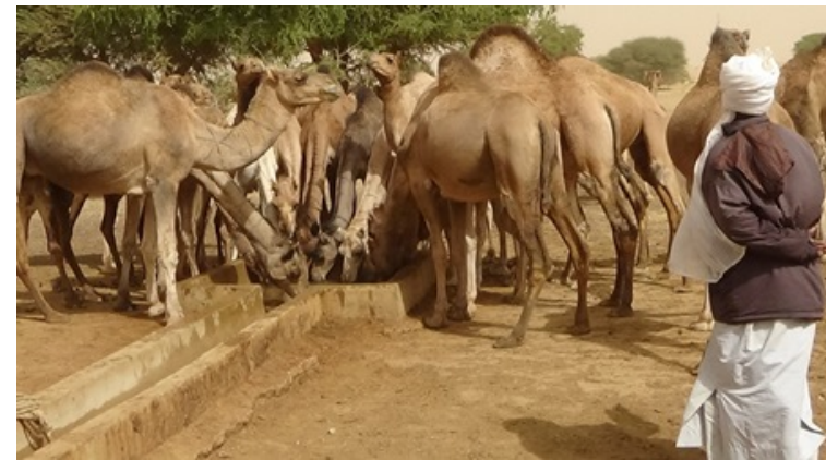
Cattle at a pastoral well recharged by a weir

The SDC helps enhance the resilience of pastoralists to the effects of climate change by improving their access to water and grazing lands and supporting the development of livestock services. Since 2014, more than 60 wells and a dozen ponds have been built, which allow pastoralists improved access to water and higher value pastoral resources. The programme, which runs from 2014 to 2026 with an overall budget of CHF 42 million, is being implemented by a consortium composed of CA 17 International, the Agricultural Research Centre for International Development (CIRAD) and the Chadian agency COSSOCIM.