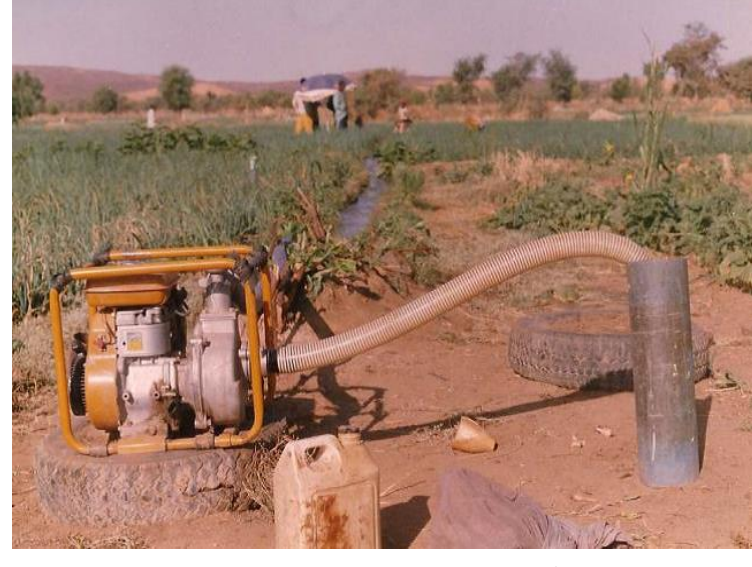
Improving resource management is a key component of the programme

PAPI is financed by the SDC and executed by the national network of chambers of agriculture, the regional chambers of agriculture, local authorities, and farmers' organisations in the Dosso and Maradi regions.