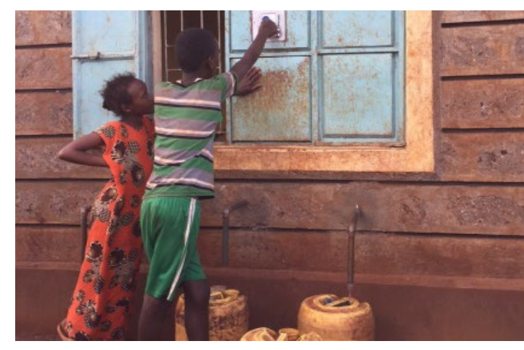
Children accessing water with a token

SDC has been supporting the project since 2015. Up to 2020, the total support will amount to CHF 7.29 million.