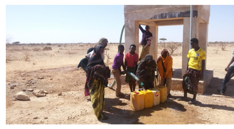
Women in Aato Village, El Barde District of Somalia, access water from an elevated water tank. The water tank is part of a multiwater use system which includes a borehole and water pump that were installed by SomReP to serve the village.

The programme has trained water user committees on natural resource management for sustainable use of water sources. After sensitisation, communities started group savings funds to maintain and repair water sources in cases of breakdown. The success of the community water management was felt in the last drought: functioning water sources in SomReP-intervened locations prevented communities from migrating to other areas in search of water.