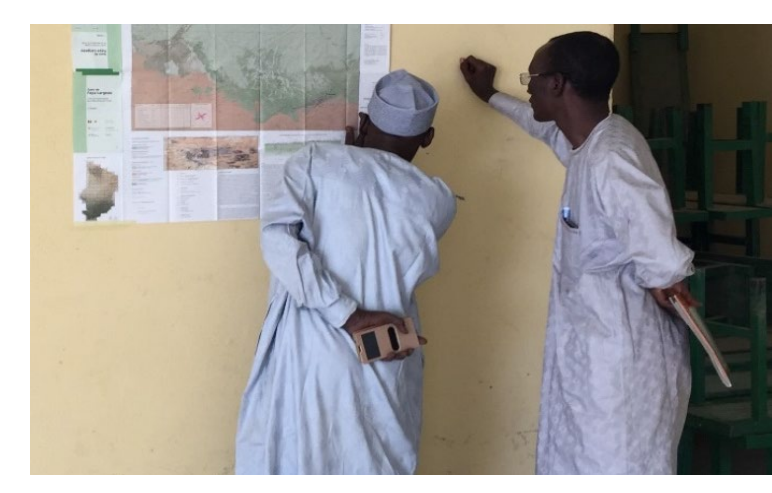
Local well diggers reading the map of the Faya-Largeau Oasis in Northern Chad

For more information contact pascal.vinard@eda.admin.ch, SDC Chad