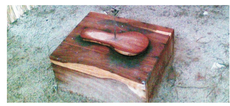
Construction and use of WASH infrastructure is supported through the PRONASAR Common Fund

Through its engagement in this rural WASH Common Fund, Switzerland aims to contribute to: the satisfaction of basic human needs; improved wellbeing; and reduced rural poverty, through increased access to, and use of, improved water supply and sanitation services and better hygiene behaviour. The first contribution to this common fund was made in 2009 and so far. CHF 7.1 million has been disbursed. Switzerland is in the forefront of the ongoing reform of this fund to make the fund more innovative, efficient and relevant.