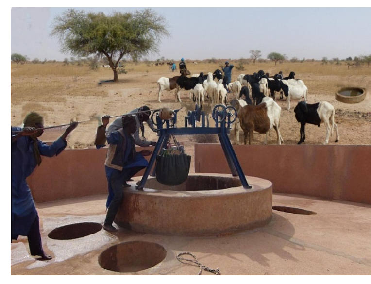
A pastoral well in ROUGA BATAFADOUA, Maradi region, Niger

The PHRASEA is financed by the SDC and implemented jointly by HELVETAS Swiss Intercooperation and HEKS. The project started in 2012 and its second phase is planned to end in 2021.