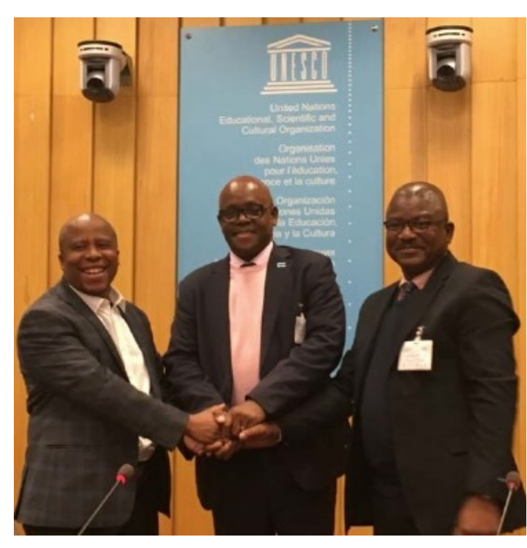
High-level Representative from South Africa, Botswana and Namibia endorsing the set-up of the Working Grop for the establishment of the Stampriet Multi-Country Cooperation Mechanism (MCCM).

tion, illustrating the concept of a real Integrated Water Resources Management and Governance, covering both the surface and the groundwater.