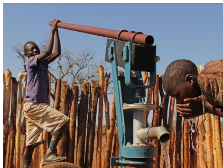
Innovation from Zimbabwe: the Bush Pump

in the sector, with the goal of enhancing and sustaining the gains made through the SDC investment.