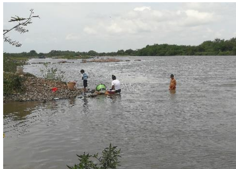
Water is a vital resource used for many purposes

The Territorial Water Governance Program in Region 13 of the Gulf of Fonseca aims to contribute to the development of an Integrated Water Resource Management System in a gradual manner by empowering the Watershed Councils. These councils are platforms for public-private agreements that can ensure water management is done in an integrated, sustainable and equitable manner.