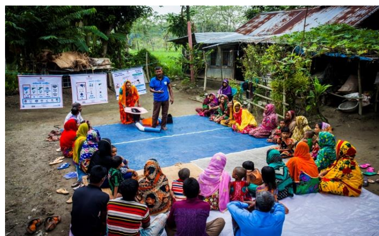
Creating demand for sanitation solutions

poor and disadvantaged people in six rural districts of Bangladesh with better health and well-being through improved sanitation. Funded by the SDC and UNICEF and implemented by iDE, SanMarkS builds household demand and private sector supply of hygienic latrines. Additionally, the project engages the public and development sectors to create an enabling environment for these market-based activities. At midpoint, the project has