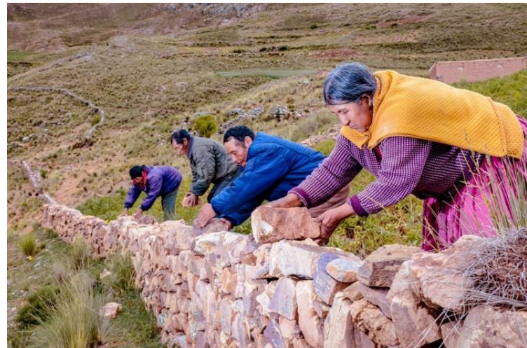
Building structure to harvest water in the landscape

Watershed management is central to the conservation and use of water resources. Such management means working with the flow of natural ecosystem processes, cultural values and social norms and governance to maintain the availability, distribution, access and use of water resources for different activities. The Integrated Water Management project, funded by the SDC and implemented by HELVETAS Swiss Intercooperation, has been contributing for years to the country national policy on watershed and water management through the National Watershed Plan of the Ministry of Environment and Water. Water harvesting for different uses is central to the strategy of improving the wellbeing of rural populations and their agricultural activities. Thanks to the Swiss support, since 2013, 44,000 families inhabiting an area of more than 88,000 hectares in Bolivia apply now better land and water management practices, thus improving their ecological resilience.