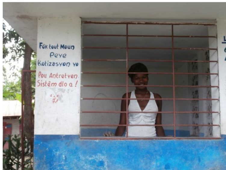
Women play an important role in the management of water kiosks in Haiti

will last 12 years (2017-2028) and the planned SDC contribution is 30 million CHF.