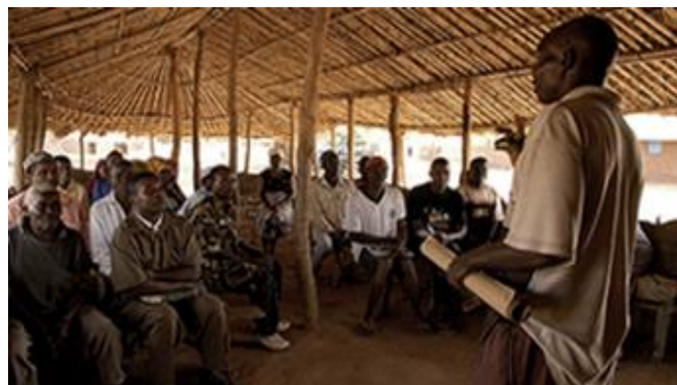
Community meeting in Cabo Delgado

In the past eight years, ten thousands of people gained access to safe and affordable drinking water and equitable sanitation and hygiene services through the support of the SDC. This is an important contribution for a country in which 74% of the rural population still do not have access to equitable sanitation services and 45% to safe drinking water, respectively.