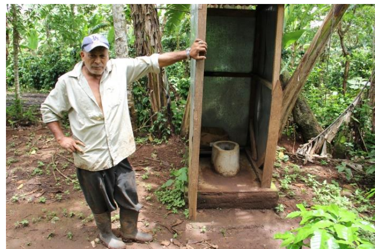
Expertise from Brazil and Switzerland may make latrines a thing of the past in Central America

The Small Towns and Schools programme (PCE) has been implemented in Nicaragua and Honduras between 2010 and 2017. Throughout the project more than 30,000 people gained access to sanitation services in small cities of Nicaragua and Honduras by implementing the so-called condominial sewerage systems, which are very common in Brazil. The process initiated by the programme is even more relevant than the numbers because the technology opens a range of options to deliver better sanitation services for this region. Most importantly, condominial sewerage systems reduce the costs by about 40% compared to conventional sanitation systems, according to the Brazilian experts involved in the project implementation. Switzerland is helping the up-take of this technology in other contexts, in this case by fostering cooperation between actors from Brazil and Central America.