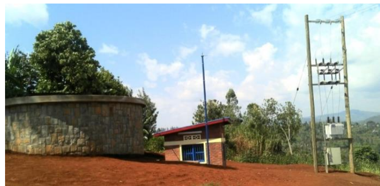
Reservoir with pumping station – Rwanda

the Programme has an important positive impact on the population's hygiene behaviour and health. By mid-2018 the PEPP is expected to finalize its DR Congo component focusing on water supply and school sanitation of a peripheral district of Bukavu.