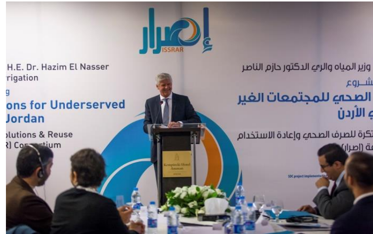
Kick-off meeting of the project in Jordan in 2017

Under the patronage of H.E. the Minister of the Jordanian Ministry of Water and Irrigation, the SDC launched the first phase (4 years) of a programme entitled "Sanitation Solutions for underserved communities in Jordan". The project, implemented by BORDA and Seecon, aims to enhance the efficiency of Waste Water Treatment (WWT), to increase sanitation coverage, and to turn waste streams into physical and financial resource streams by ensuring and promoting safe reuse of treated wastewater and faecal sludge. As a result, the project will contribute to reducing environmental risks, creating better living conditions, social cohesion and improved resilience within host communities in Jordan. Access the brochure about innovative sanitation solutions here .