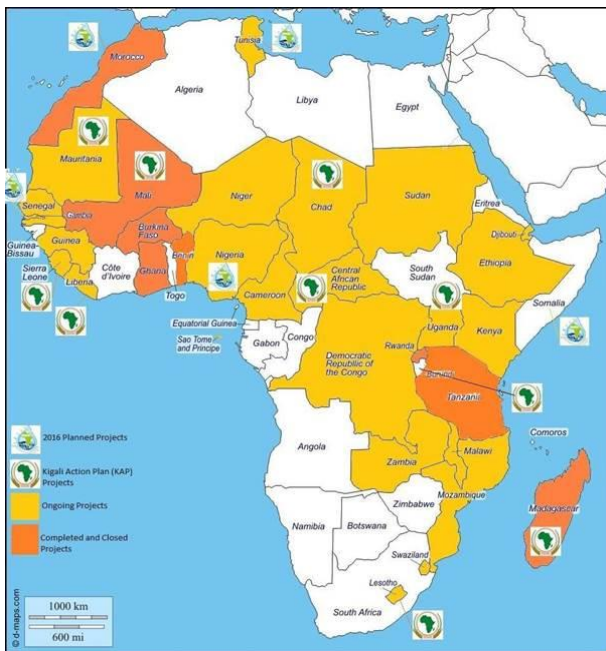
Countries with Bank-Funded RWSSI Projects/Programs and Studies as of 31/12/15

In 2003 the African Development Bank (AfDB) launched the Rural Water Supply and Sanitation Initiative (RWSSI) as the leading mechanism to support African governments in their efforts to improve Rural Water Supply and Sanitation and to achieve the MDGs as well as the goals of the African Water Vision. In 2005, a RWSSI Trust Fund (RWSSI TF) was established to mobilize additional funding for RWSSI. The SDC joined the RWSSI TF in