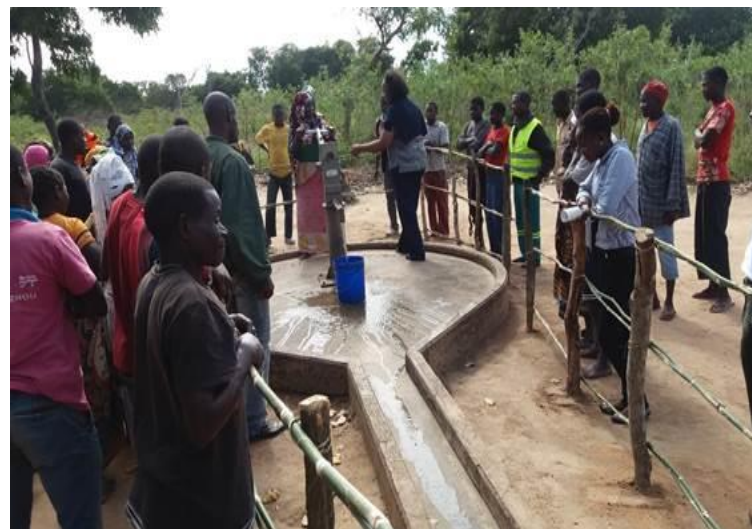
A completed water point in Nacuculo Village, Mogovolas District, Mozambique

The active role of the SDC in the Steering Committee and its involvement in the strategic planning process allowed to bring in key topics such as fragile states, gender mainstreaming, decentralization of service provision, governance, the Human Rights to Water and Sanitation, among others. The SDC provided additional support to AfDB through financing a technical advisor on monitoring and evaluation.