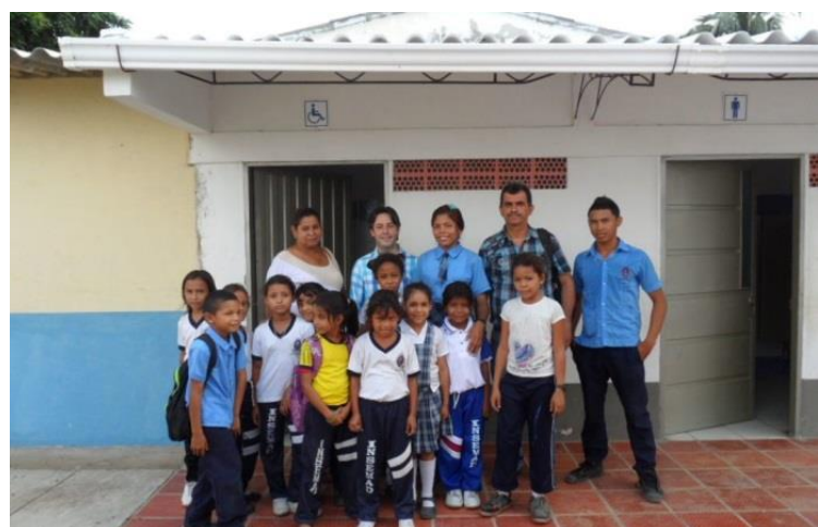
Rural schools were supported as part of AquaFund's pilot project on WASH in rural areas of Colombia, Peru, Honduras and Mexico

leveraging of IDB loans makes AquaFund a very efficient tool for the water sector development.