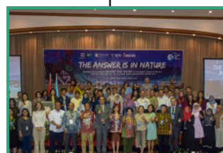
Asia-Pacific Forum on Sustainable Development, Jakarta, March 2018