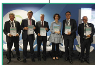
8 th World Water Forum, Brasilia, March 2018