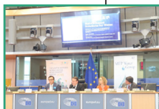
European Parliament, May 2018