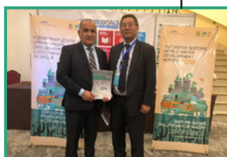
UNESCO Office in Tashkent, June 2018