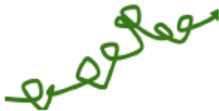
Complex unpredictable change