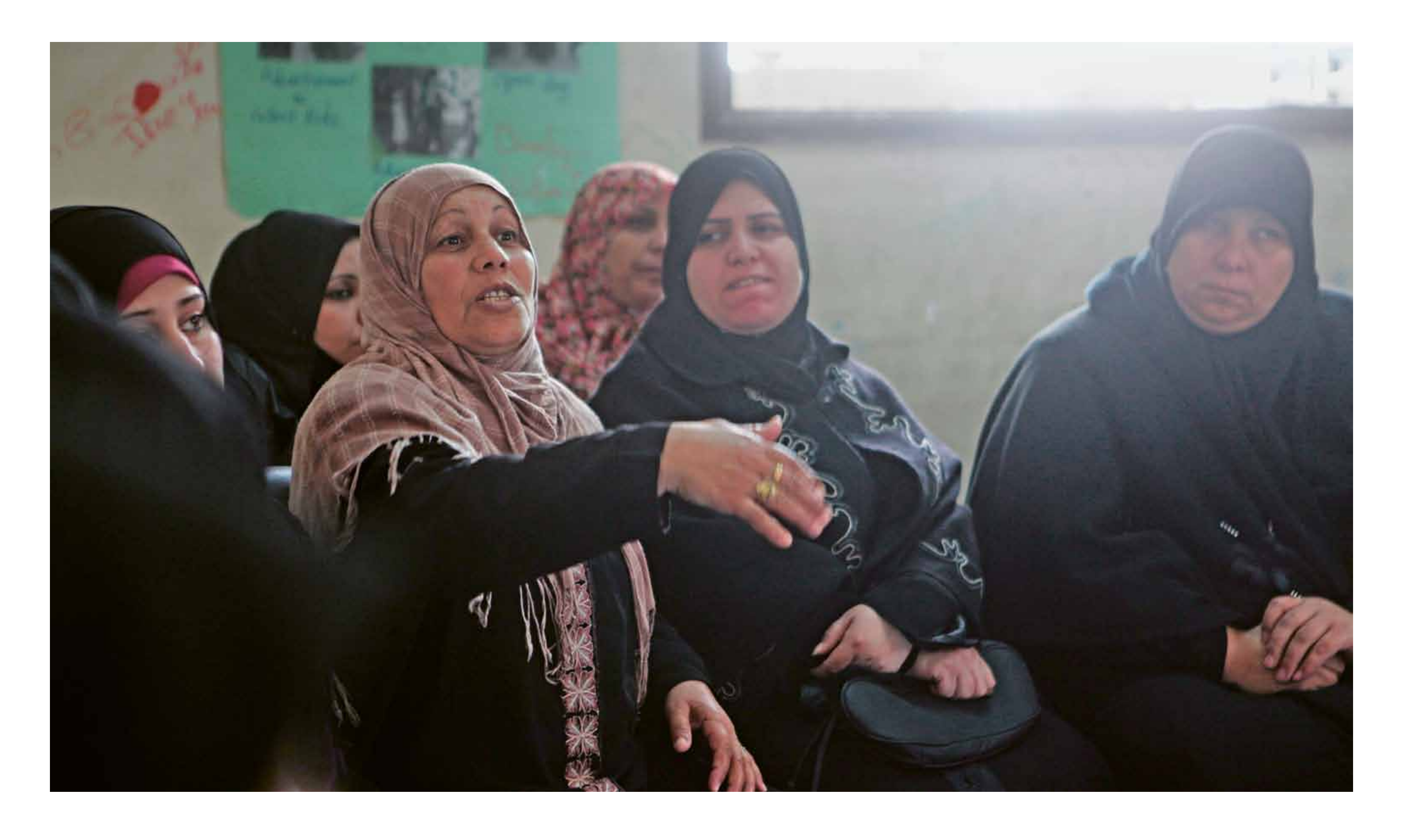
The Men's Point of View