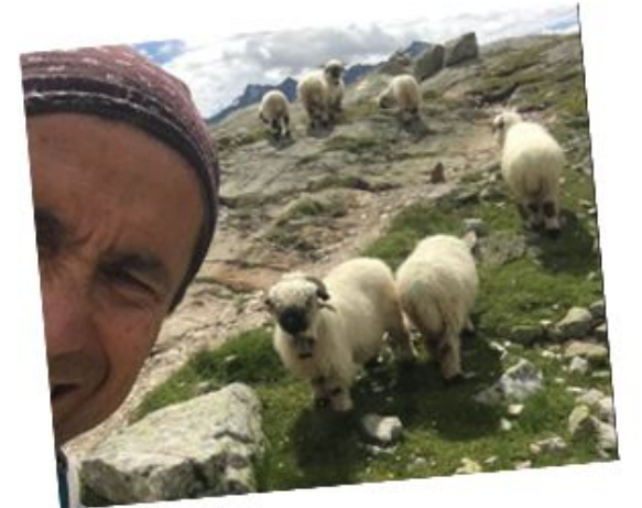
I like hiking, spending as much time as possible outdoors

Important to me: work life balance and my family