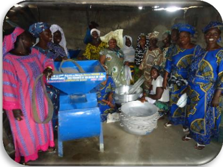
Appui matériel au groupement féminin IMO TOTO de Savè pour la fabrication de l'huile d'arachide 2012