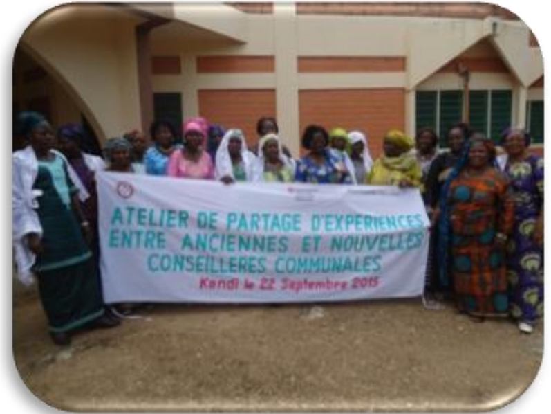
Atelier d'échange d'expériences entre anciennes et nouvelles élues à Kandi le 22 septembre 2015