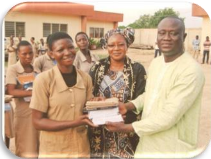
Prix aux meilleures élèves filles de la classe de 3ième des collèges de Kandi (2013)