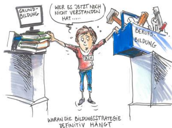
What the Education Strategy really depends on

«I would love to know what's written there.»