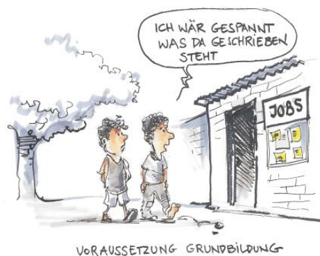
Prerequisite Basic Education

Thanks to the SDC's and SECO's programmes – which are carried out in a complementary manner – Switzerland's international cooperation in the areas of basic education and vocational skills development in the South and the East is now reaching even more countries and people, meaning less poverty, more economic development, better social cohesion, and providing prospects and protection in crisis situations.