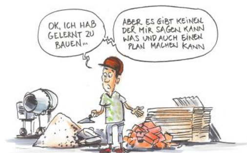
There is a need for higher qualifications

The SECO position paper for strengthening skills is oriented towards the private sector and is focused on continuing vocational training and on dual and sector-specific training in the formal sector. The position paper focuses on the tertiary education level and the formal area. Higher skills levels should help to increase productivity and create better jobs and thus promote the economic and social development of partner countries. The SECO position paper sets out three distinct areas for intervention: (1) framework conditions of the labour market at the macro level, (2) national tertiary level education systems at the meso level, and (3) advanced, practical training at industry/enterprise level. The participants were particularly interested in SECO's handling of the challenges of digitisation and viewed favourably the complementarity of SECO's positioning with other federal agencies active in international vocational training cooperation.