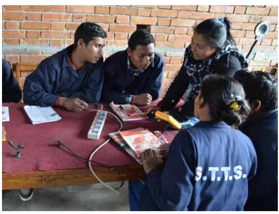
Trainee electricians: A woman trainer in Nepal explains the concept of electrical circuits.

Swiss Agency for Development and Cooperation SDC