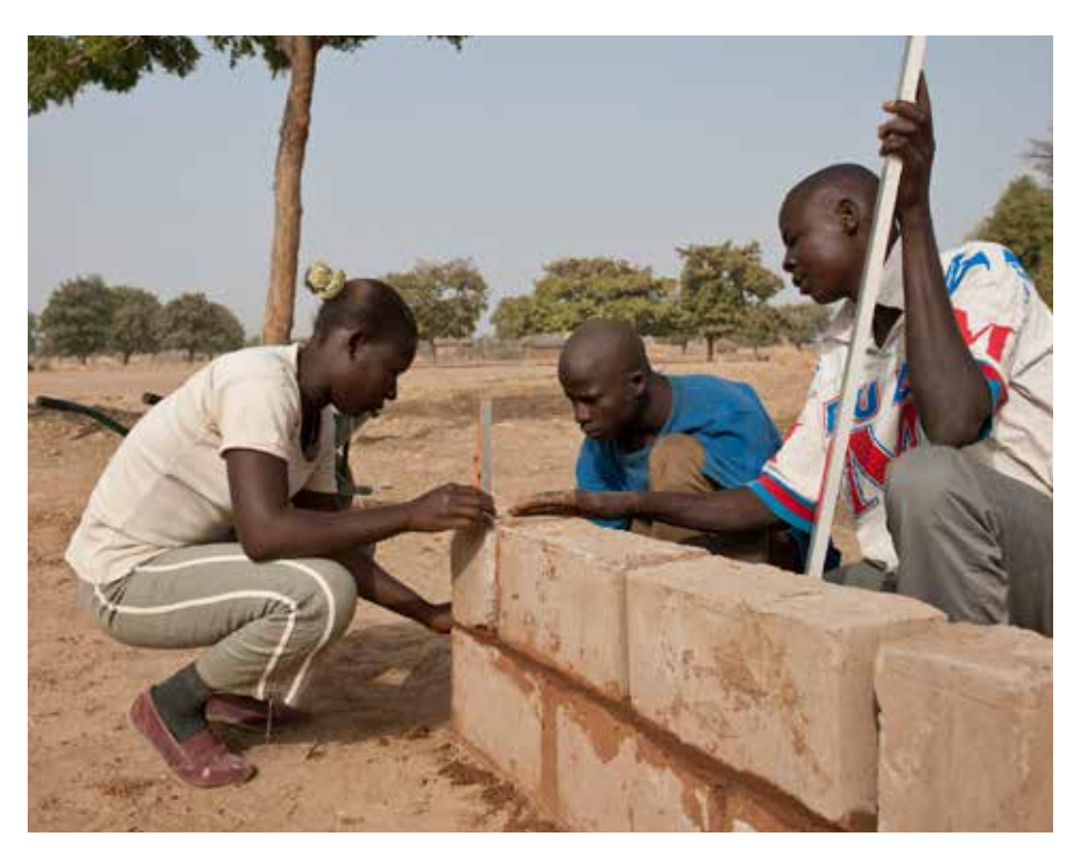
Trainee masons: A woman trainer in Benin provides advice

ket. Female role models who can inspire younger women to take up responsible jobs are often an important force for change.