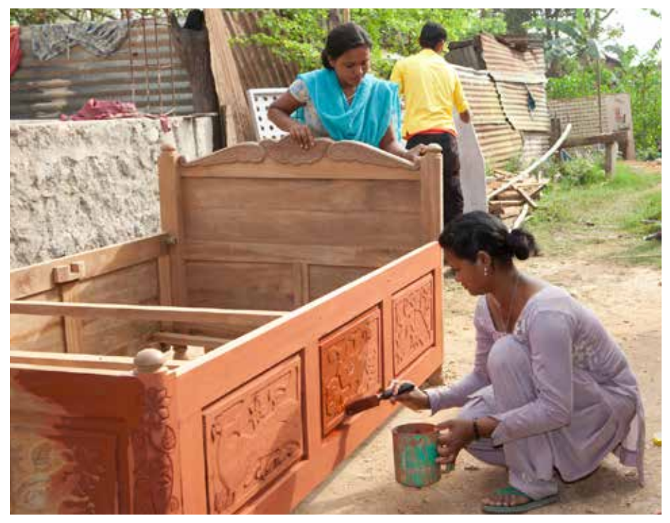
Trainee carpenters: Two young women of the Tharu ethnic minority in Nepal learn new skills

acknowledged the innovative and successful nature of the project, but noted that the definition of "gainful employment" was crucial. Many trainees from disadvantaged backgrounds had some income after 6 months, but not enough to be rated in gainful employment; the training institutions thus failed to receive final payment for their training.