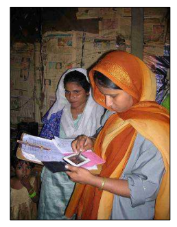
Collectors using palm pilots

portfolio. In 3 years, the first 'palm' branch has accumulated a loan portfolio (CHF 66'924) close to the loan portfolio of the youngest 'manual' branch (CHF 85'959) that has been running for 5 years.