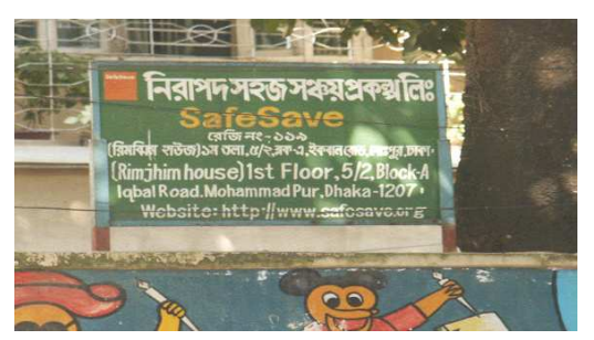
SafeSave's Head office in Dhaka in 2005

The author conducted the research over three months in Dhaka, Bangladesh, in late 2005. The results of the study are based on a comparison of income statements between branches with and without palm pilots and on interviews with staff and clients. Finally, conclusions are also drawn on the applicability of this technology for Microfinance Institutions (MFIs) working in rural areas.