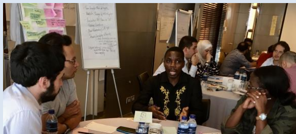
2017 Workshop participants discussing a case

"The cases were really informative, and choice and blend of cases was superb."