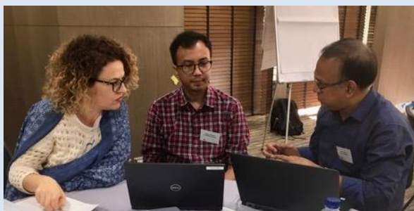
2019 Workshop participants focused on an exercise.

It will start at 8:30 am on the 9 th of October and close at 2:00 pm on the 13 th of October.