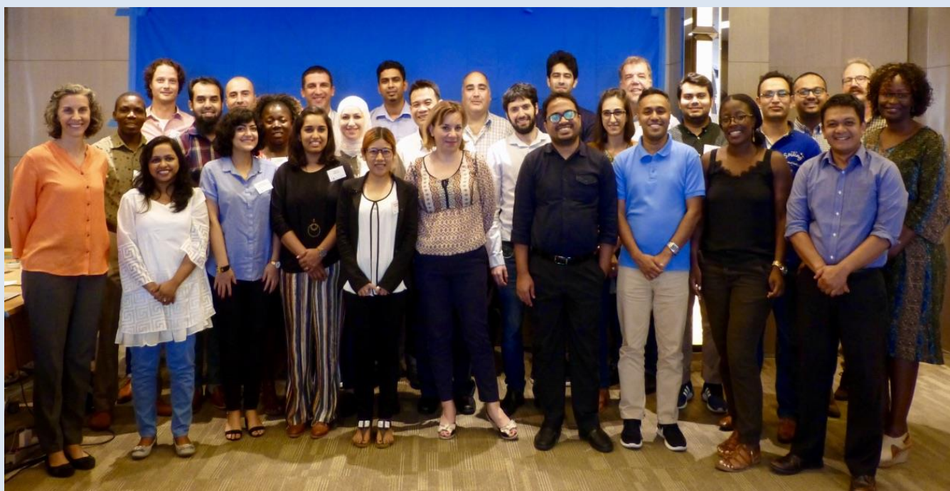
2017 Advanced RM Training Workshop Group

Partial scholarships are available on a competitive basis for those who apply before 15 th June 2023.