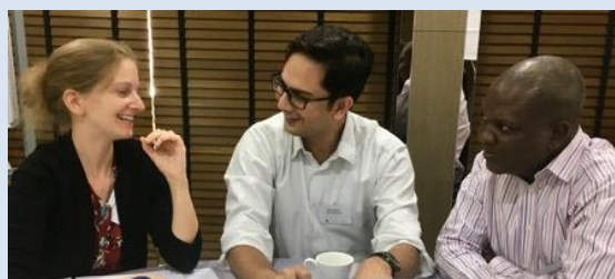
Participants tackled challenges in groups at the 2019 Advanced RM Training Workshop

This unique training workshop will bring together experienced results measurement practitioners to share lessons learned, solve common problems, exchange practical approaches to address identified challenges and build a supportive network. Participants will become more capable and confident to lead results measurement in organizations that aim to catalyse system change across the world.