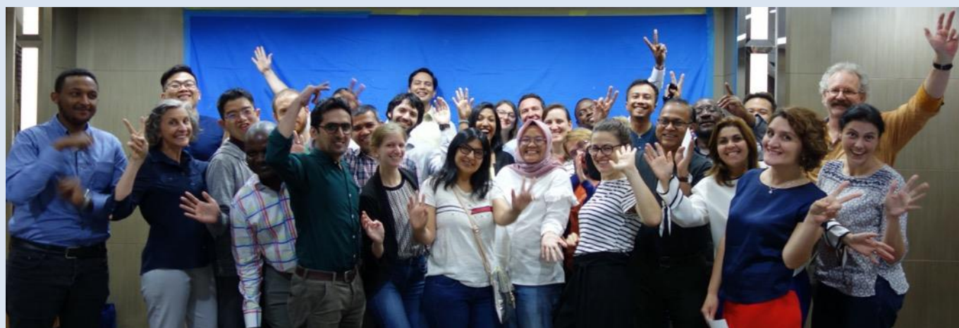
2019 Advanced RM Training Workshop Group

To attend this training workshop, you must have at least 2 years of practical experience applying the DCED Results Measurement Standard.