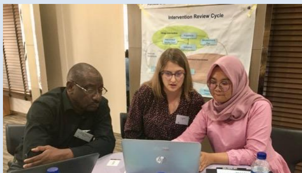
Participants working on a case assignment, November 2019

The event will combine training sessions on good practices and successful examples of assessing system change with workshop sessions where the field is still searching for practical approaches, particularly assessing complex dimensions of system change.