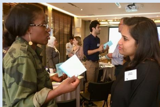
Exchanging tips during the 2017 Advanced RM Workshop

You will leave the training workshop with new knowledge, improved skills, practical tips, more confidence and a network of experienced colleagues.