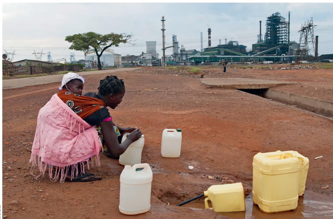
Mutter mit Kind holt in der Nähe einer Kupfermine in Sambia Wasser. Der Rohstoffabbau führt mancherorts zu Interessenkonflikten.