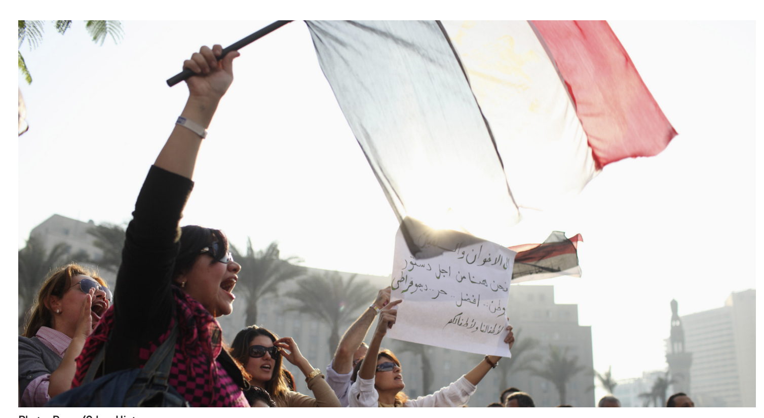
Male and female protesters shout and wave flags and placards during a demonstration in Tahrir Square, November 2012