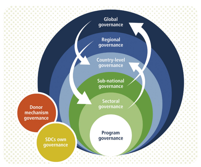
Figure 3: Different levels of governance

principles allow public systems to respond adequately to multiple development challenges.