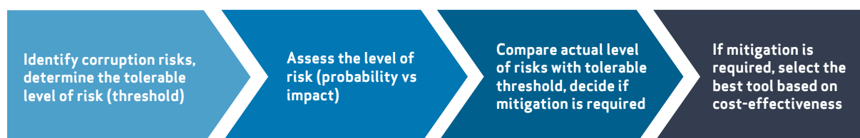
Figure 1. Four-step corruption risk management model

Sources: This model draws on the risk management approach recommended by the International Organization for Standardization (ISO) in its 31000 framework, the Deming quality circle, and the model developed by Leitch (2008).