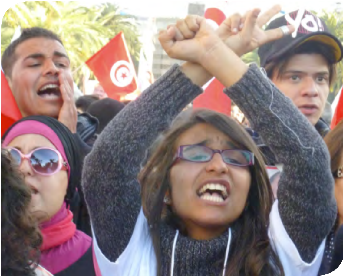
Young Tunisian woman at the opening march of the World Social Forum, Tunis, March 2013.