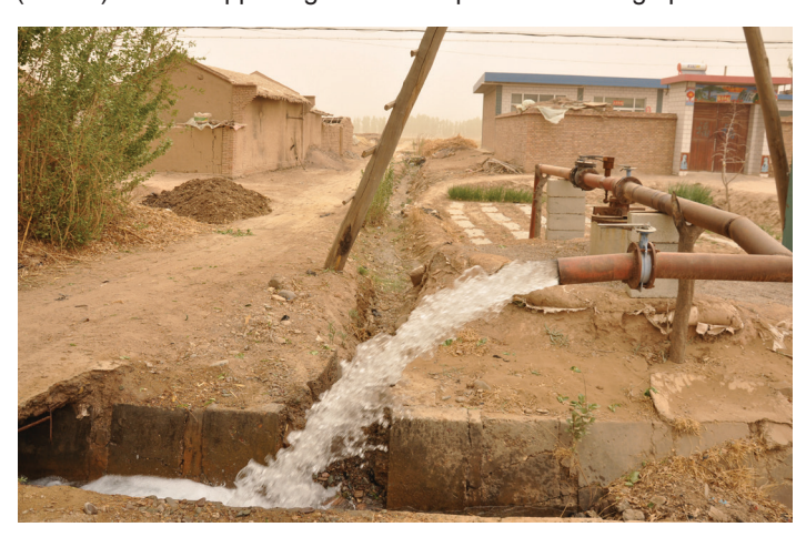
Groundwater supply

A detailed design of a GEF (Global Environmental Facility) funded project entitled 'Andes Adaptation to the Impact of Climate Change in Water Resources' is being undertaken by HELVETAS Swiss Intercooperation, on behalf of the four governments of Peru, Ecuador, Bolivia and Colombia. This USD 9.7 million project will build on the lessons from projects supported by the World Bank, GEF and SDC that contribute to enhanced adaptation to climate change. Helvetas is providing both thematic and project management support during the 6 months design phase, leveraging experiences and competences from projects it is implementing in the region. The GEF project will have a specific focus on priority sectors that are highly dependent on water and shall improve their resilience to climate change impact on water resources. Building on past experiences from pilot actions, the project shall have a sectoral focus, sharing learnings among sector actors in the four partner countries. Recognising the regional importance of the project and the possibility to mainstream lessons from Swiss development cooperation, SDC's Global Programme Climate Change (GPCC) is also supporting technical inputs to the design phase