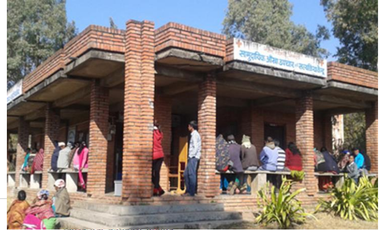
जिल्हा जनस्वास्थ्य कार्यालय धनौरी स्वास्थ्य चौकी, दाह त्रिबर्षिय कार्ययोजना-२०७२/७३-२०७४/७५