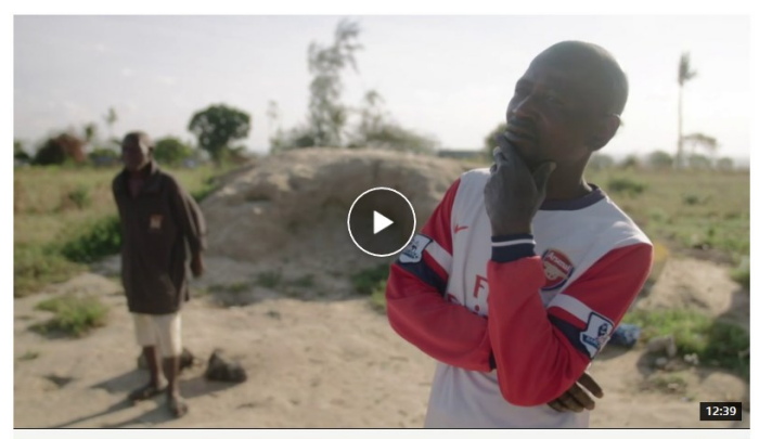
Bargeld: Segen – oder auch ein Fluch?

Cash Assistance – from a development angle – was prominently featured in the SRF science TV programme «Einstein im Krisengebiet – wir helfen, was bringts?» which focused on SDC/HA's work in humanitarian crises (article; TV programme).