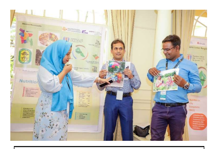
Bangladesh teams making a presentation of NICE food