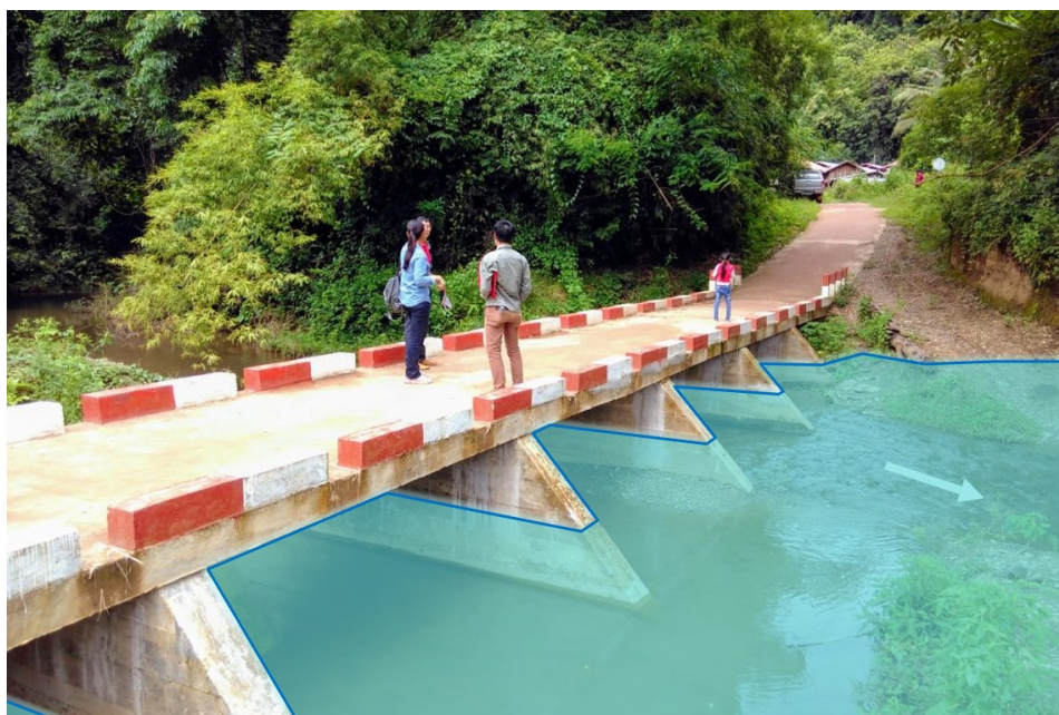
Engineers from the Poverty Reduction Fund (PRF) and SDC Regional DRR Advisors conducting a risk assessment at a newly constructed bridge in Chomphet District, Luang Prabang Province, Northern Lao PDR, 2017