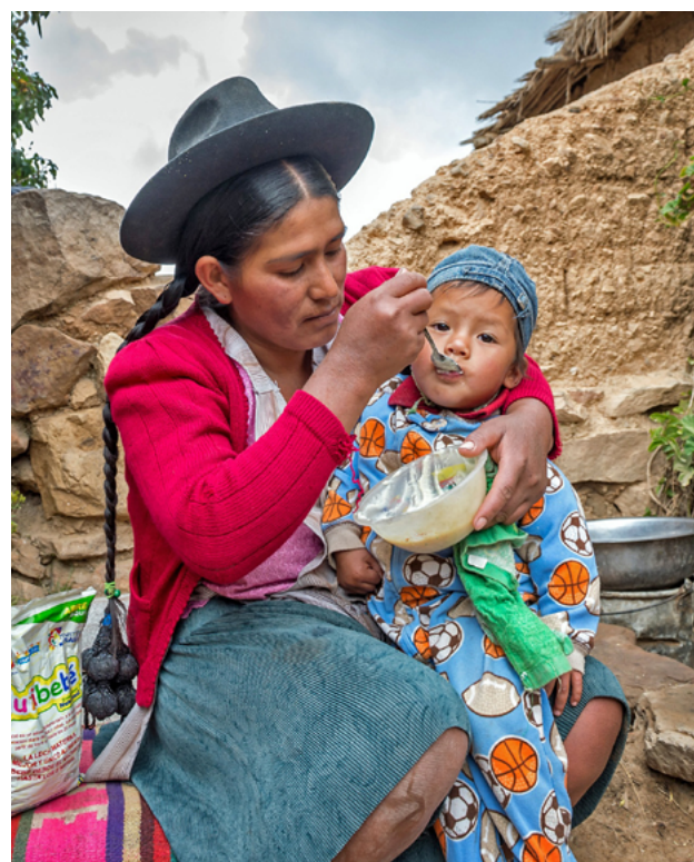
Nutrition campaign, Bolivia.