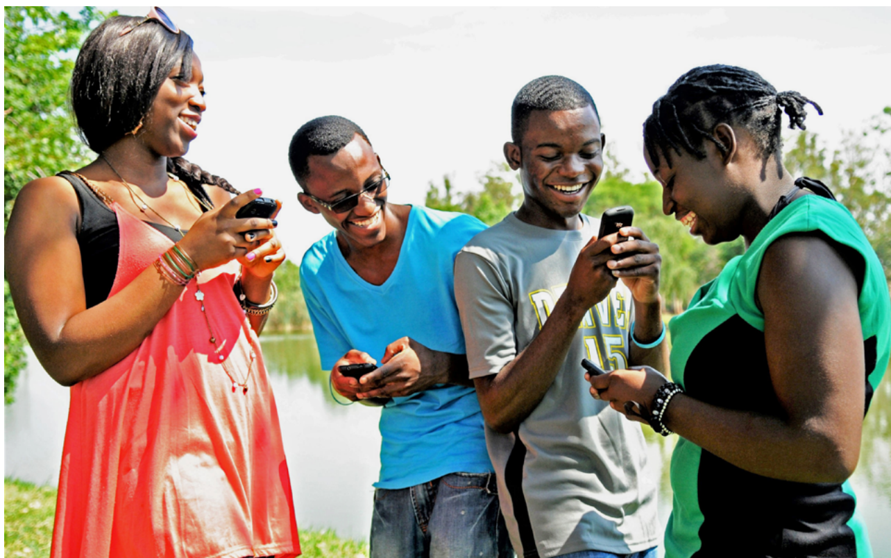
Youth and technology for health, Zimbabwe.

If, through the GPH’s policy and programmatic work, health systems are of better quality, and if key determinants of health are effectively addressed (such as malnutrition and environmental pollution), and if specific needs of disadvantaged people, such as women, young people and migrants are considered, and if governance mechanisms for global health are more inclusive, efficient and effective, then the health and well-being of disadvantaged people in low and lower-middle income countries can be improved and protected. This is because the drivers of inequity, such as gender, socioeconomic status, educational level or age are targeted in all components.