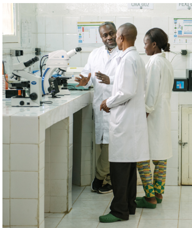
Strengthening research in endemic countries, Democratic Republic of Congo.