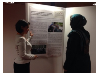
Poster presentation at the GHF

The SDC-funded project Enhancing Primary Health Care Services, Tajikistan (Sino V) presented two posters at the Geneva Health Forum this year: Assessment of knowledge and behaviour of cardiovascular risk factors among adults in communities of South Tajikistan and Innovative approaches to strengthen decentralized management capacities in Central Asia . The