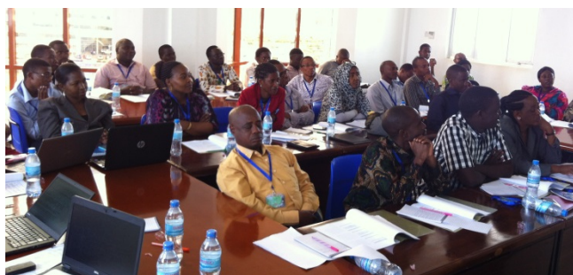
The Health Promotion course participants at UDOM

In April this year the University of Dodoma (UDOM) launched its first short-course on Health Promotion. This course is run jointly by the Colleges of Health Sciences, Humanities and Social Sciences. SDC's Health Promotion and System Strengthening (HPSS) project provided support by training trainers and developing the curriculum and training materials.