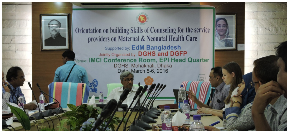
EdM Bangladesh; Dhaka, Bangladesh; March 5, 2016