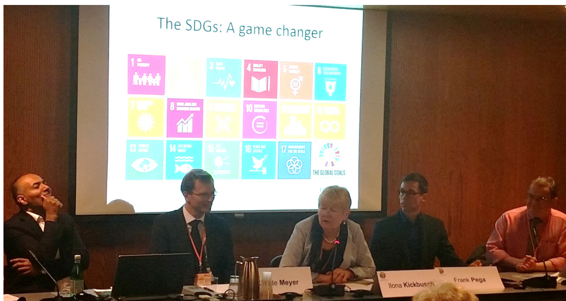
Panelists on multi-sectoral approaches

The Geneva Health Forum, held 19-21 April 2016, was dedicated to “Global Health: Sustainable and Affordable Innovations in Healthcare”. SDC was one of the main sponsors and also contributed actively to the forum via its information booth, partner presentations and sessions. A summary is available on the CUG and can be accessed here