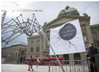
Ceremony on the Federal Square reaffirming Switzerland's leadership role to end malaria

Switzerland is a pioneer in the fight against malaria and the Swiss Malaria Group (SMG) www.swissmalariagroup.ch , chaired by SDC unites all major Swiss-based stakeholders active against malaria. On the occasion of World Malaria Day on 25 April 2016, the SMG organised an event at the Federal Square in Bern reaffirming Switzerland's leadership role in ending malaria. The presidents of the Swiss National Parliament, together with 10 parliamentarians signed the "Bern Declaration on Malaria" and WHO Director General Margaret Chan thanked SMG members for their engagement.