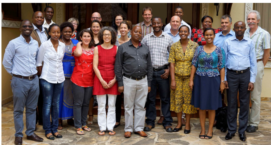
Face2Face in Tanzania

Contact person: jean-francois.golay@eda.admin.ch