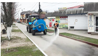
▼ Disinfecting streets, Vinnitsia reg.

So the Swiss-Ukrainian Decentralization Support Project DESPRO initiated creation of the section “Local Self-Government in Response to Coronavirus” on the Decentralization web portal in March 2020. The primary goal of such a section is giving the platform for disseminating successful COVID-19 response practices by communities across the country. Additionally, the section provides materials on Ukrainian and European communities’ response, methodological recommendations on crisis communication and organization of remote work for governing bodies, etc.