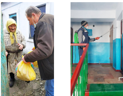
▲ Delivering food packages and disinfecting hallways, Mykolaiv reg.