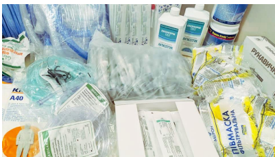
▲ Protective gear for medical staff