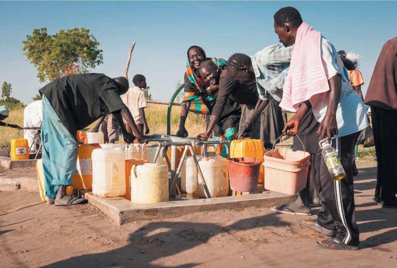
South Sudanese returnees from Khartoum fetching water in Renk, South Sudan