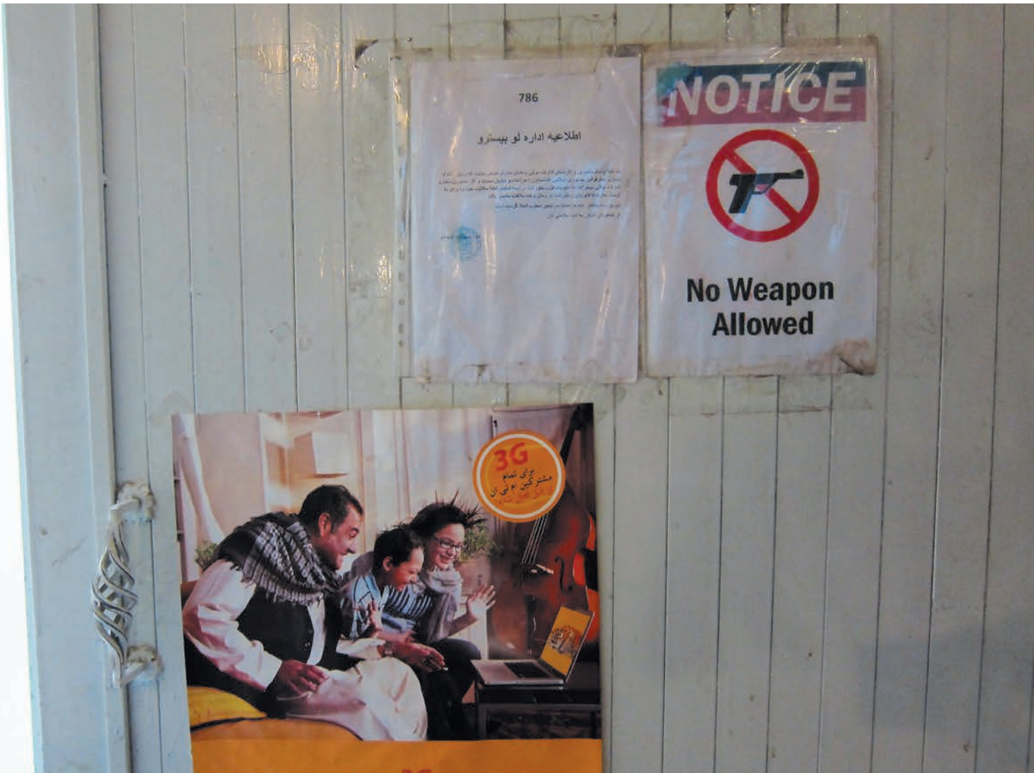
"No weapon" sign at the entrance of a shop in Kabul, Afghanistan