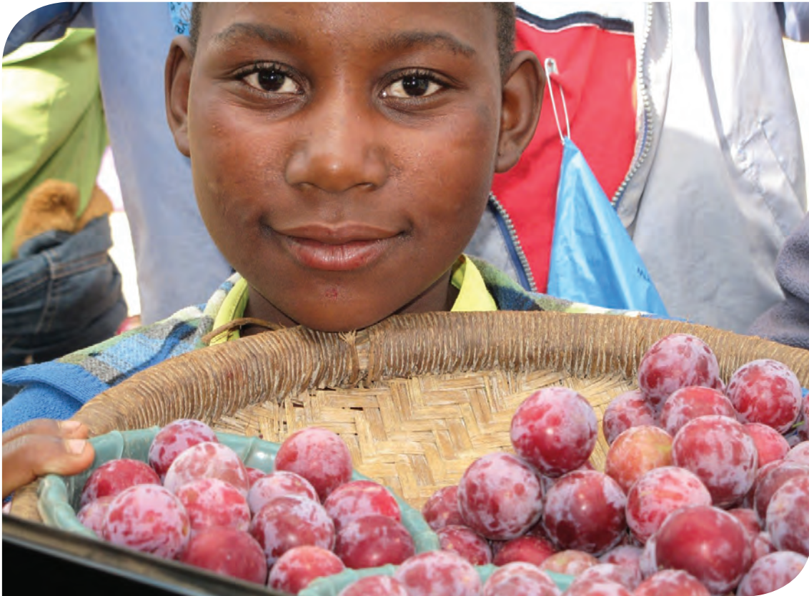
Girl selling plums by the roadside, Malawi