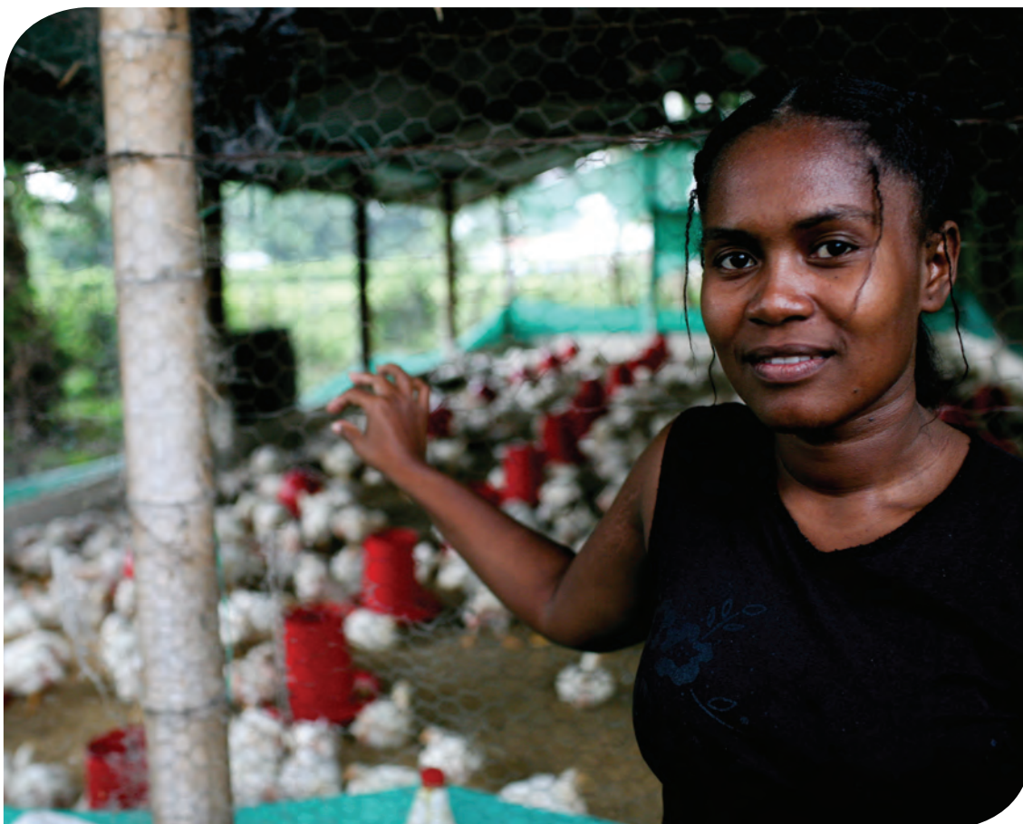
Raising poultry in Colombia