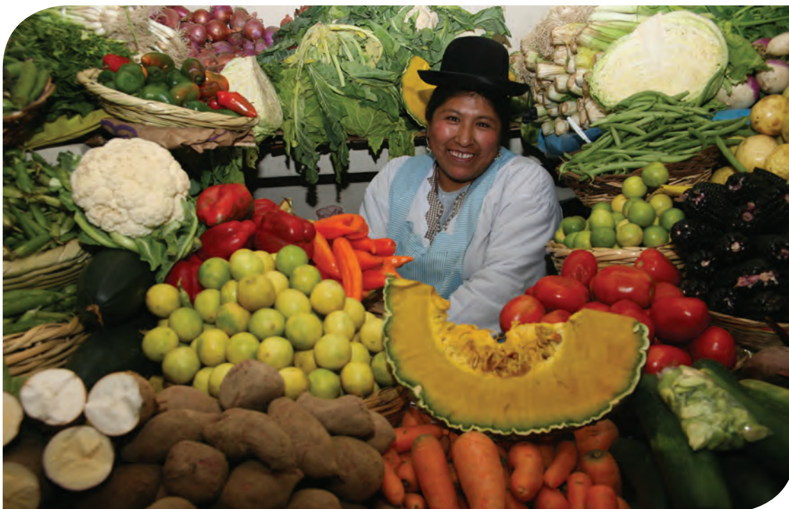
Agricultural biodiversity in a Peruvian market