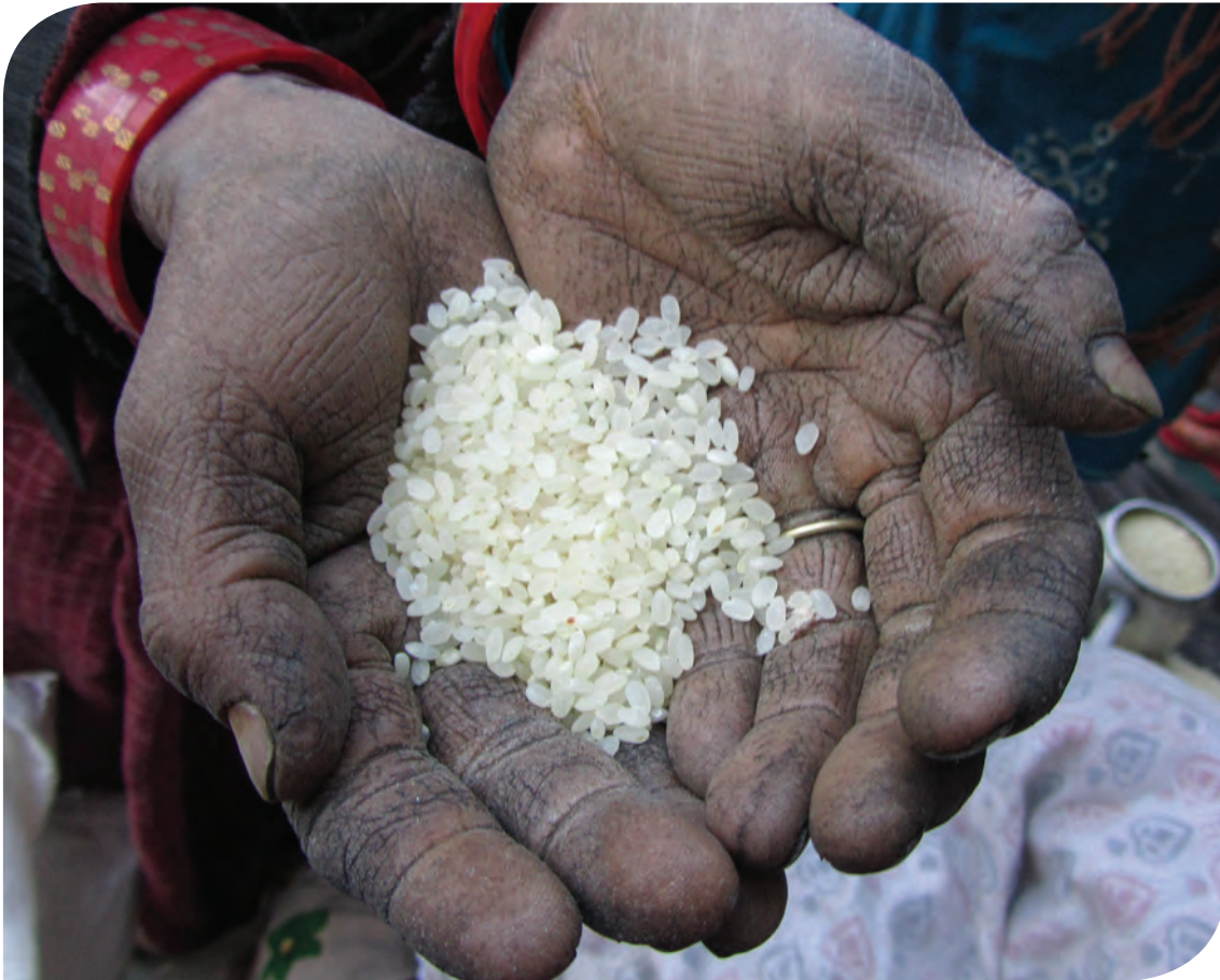
A woman collects her rice ration as part of the Nepal Food Corporation's food distribution programme