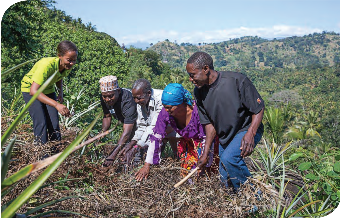
Training of the Tanzanian Network of Small Scale Farmers Groups in better agricultural techniques, Morongoro, Tanzania