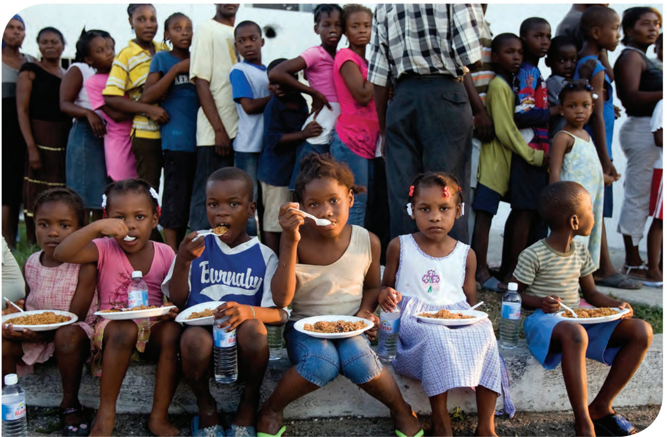
Children in Cité Soleil receive meals