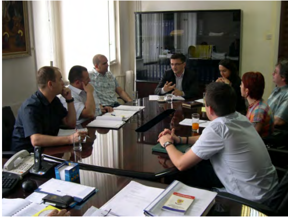
Municipality and MDP staff discuss the self-assessment