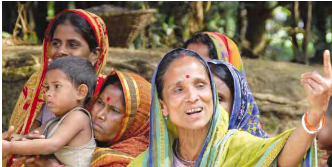
Women participating in a LSGA exercise.

The meeting is facilitated by 1 or 2 representatives of an NGO trained by the project, supported by 4-5 trained community volunteers, mostly from local CBOs. The community LGSA is organized around 19 questions; 7 about citizen’s duties/functioning for good local governance and 12 about the functioning of the UP. The community LGSA aims at getting a comprehensive perception of the community and ends with the participatory elaboration of priority issues to be addressed. A community LGSA meeting takes 3-4 hours and is conducted in several locations in one ward.