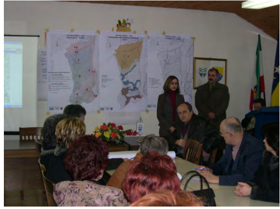
Municipality and MDP staff discuss zoning and land use maps