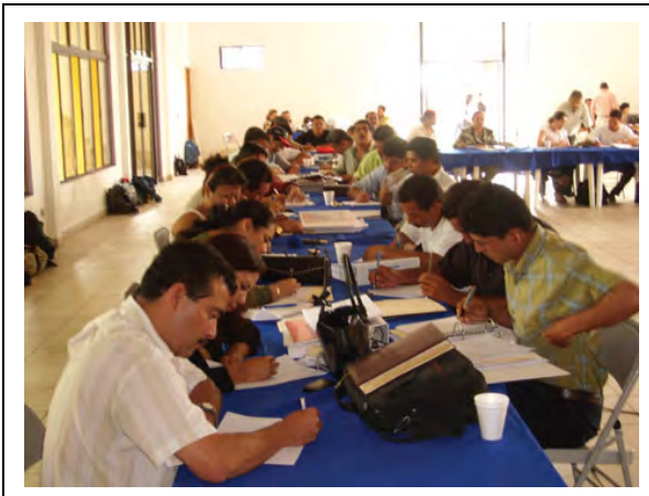
The data collection process

As concerns the nature of data, the approach of SIRDEM rather focuses on collecting observable