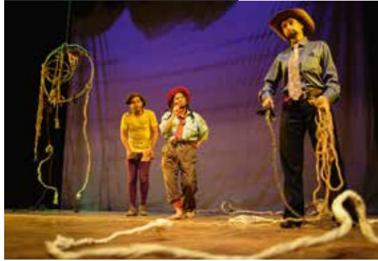
Theater performers in a drama at the Shilpokola Academy. Dhaka, Bangladesh, 2016