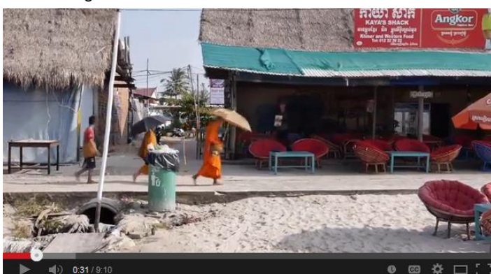
Planning for Climate Change in Cities

The video below shares the experience of Sihanoukville, a coastal city in Cambodia, in addressing the threats of climate change. It illustrates how cities are becoming increasingly important in designing and implementing climate change adaptation and mitigation. Watch the video by clicking here or on the image below