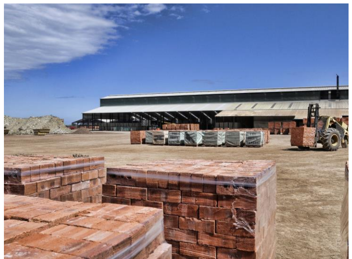
Energy Efficient Clay Brick Project in South Africa