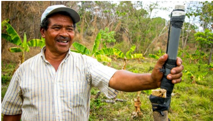
Producer showing his irrigation system, Nicaragua

Nicaragua is one of the world's most vulnerable countries to climate change impacts. After Haiti and Honduras, it is the third country in the region most likely to suffer a crisis due to a disaster, e.g. hurricane, flood and drought. Impacts of disasters are expected to be even greater due to high levels of environmental degradation of the land and watersheds. The effects of climate change are most severe on agricultural activities. The rural poor, especially women, will be affected the most. In this context, the PAGRICC was designed to reduce the vulnerability of the rural population in Nicaragua to climate change impacts. More specifically, PAGRICC implements activities to better manage disaster risks and conserve natural resources in 7 municipalities. While PAGRICC is implemented by the Ministry of the Environment and Natural Resources, it is funded by multiple donors, including the Inter-American Development Bank. Since October 2013 and for a period of 3 years, SDC is contributing CHF 3 million to PAGRICC. More