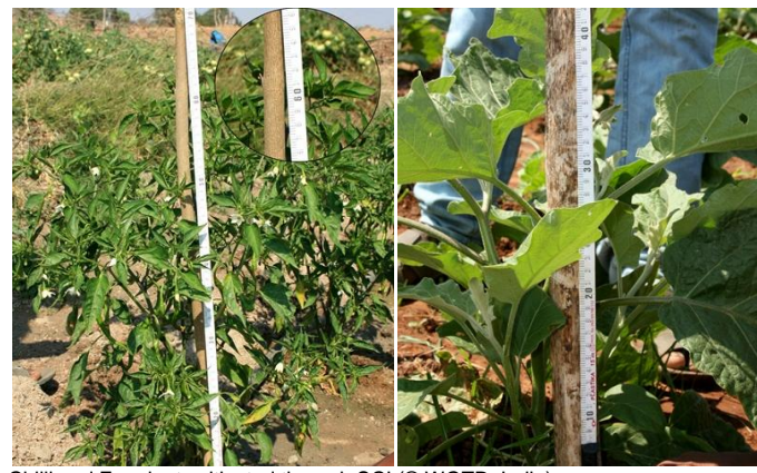
Chilli and Eggplant cultivated through SCI

Following the success of the System of Rice Intensification – a method of cultivating rice using scientific but sustainable methods – The Watershed Organisation Trust (WOTR) modified and adapted the method to other crops. Crops like maize, vegetables, groundnut, and sunflowers are productively grown by this SCI method. This is a move to promote low external inputs, increase land productivity, the use of indigenous seeds, and reduce the cost of cultivation. It includes the promotion of agricultural demonstration plots, training of farmers on better practices of transplantation, and seed treatment. More