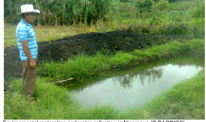
Environmental restoration and water collection in Nicaragua

Nicaragua is the second poorest country in Latin America and also one of the most vulnerable ones to the effects of climate change. Between 1992 and 2011 it ranked third highest in terms of climate risk. The economic losses due to natural disasters over the past 30 years are estimated at USD 2'000 million. While 25% of the population is at risk of floods and hurricanes, 45% is threatened by droughts. Poorer people who depend on agricultural activities for their livelihoods are affected the most. The government is trying to deal with these threats by implementing a national disaster risk reduction plan and a national strategy on climate change adaptation and mitigation. To support these efforts, SDC is cofinancing the PAGRICC which is being implemented by the Ministry for Environment and Natural Resources. The goal of PAGRICC is to reduce the vulnerability of the rural population to natural disasters and increase its resilience to climate change. For example, smallholder farmers are expected to apply environmental restoration practices and to improve their practices in agriculture and forestry in order to reduce soil erosion. More (in Spanish)