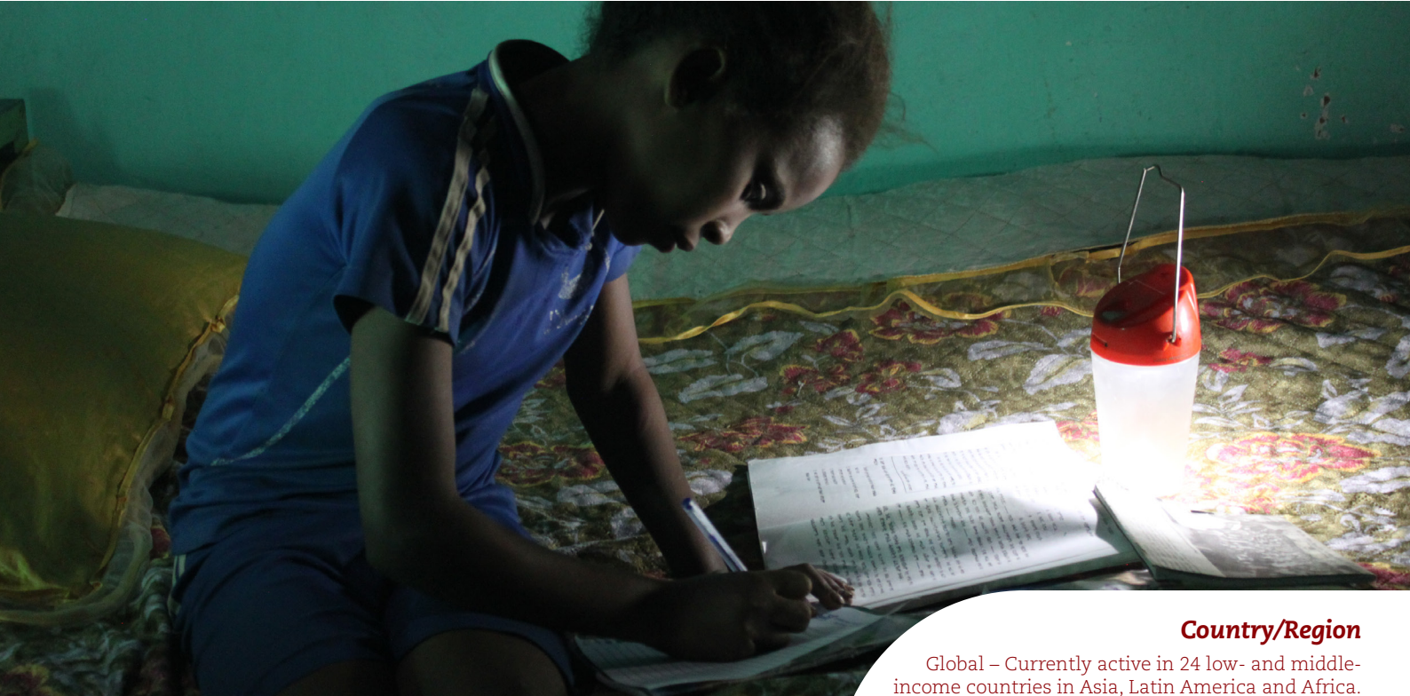
This girl is using a solar lamp to study at night in Ethiopia.