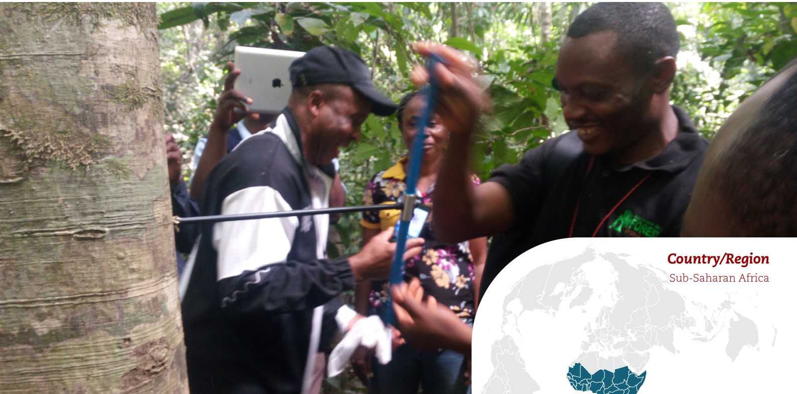
Field training on Rapid carbon appraisal in Burkina Faso