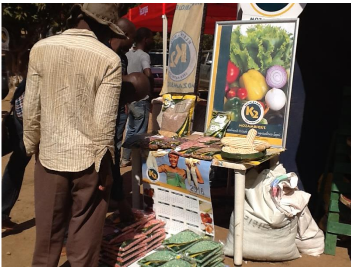
Certified seeds on display at a seed fair.

One of the key lessons learned was that farmers need finance for a wide range of services beyond simply purchasing seeds at planting. They typically used half the funds to hire labor for opening fields and planting, as well as to purchase equipment and chemicals. Those who saved, continued to increase their savings every year. A second lesson was that in areas where there was no supply of inputs, the interest in the savings decreased. So, there is a symbiotic relationship between availability of inputs and the farmers desire to save for them.